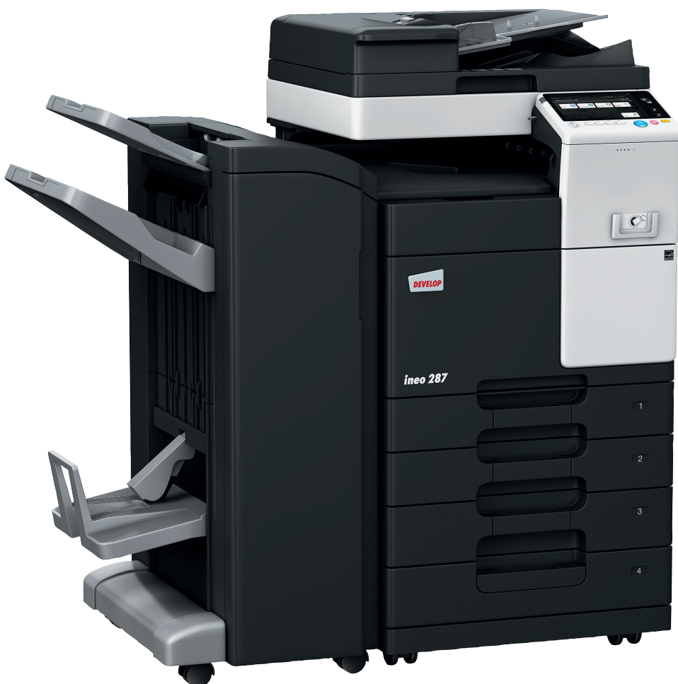
ineo 287 with document feeder (DF-628), staple/booklet finisher (FS-534SD), paper feeder (PC-213) and mount kit for local ID card authentication device (MK-735)

The monochrome devices features a variety of energy-saving functions that cut power consumption. Besides saving you money, these green features are also good for the environment – and your carbon footprint.