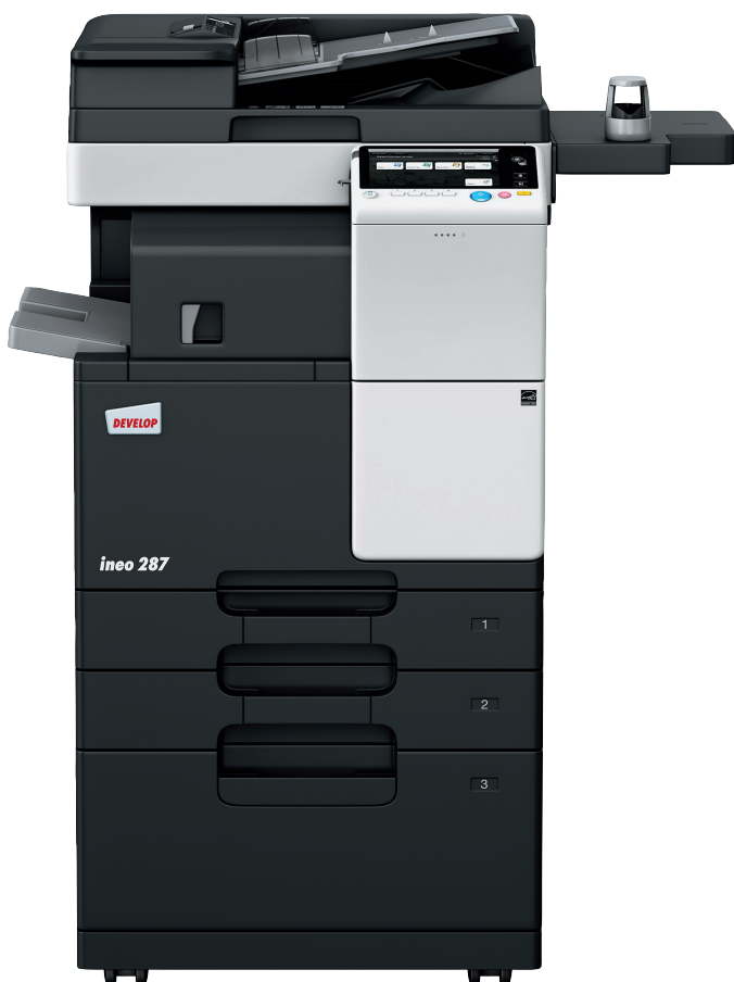
ineo 287 with document feeder (DF-628), inner finisher (FS-533), paper feeder (PC-413) and biometric authentication kit (AU-102)

Job centres, schools and universities, engineering firms, architect's offices, insurance companies, banks, libraries: many small to mid-sized businesses or organisations don't really need colour printing capabilities. What their users really require is a monochrome multifunctional device that is intuitively easy to use and offers simple mobile usability for the increasing number of mobile office workers.